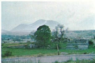
Picture of countryside without Mini.