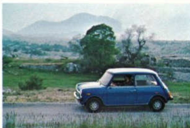
Picture of countryside with Mini. (Notice how Mini's smart styling improves the landscape!)

A Mini seats four normal adults (or three linebackers) with comfort. Yet it steals in and out of tiny parking spaces too small for lesser (that is, bigger) cars.